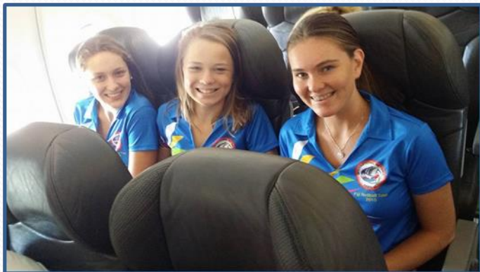
On their way to Fiji